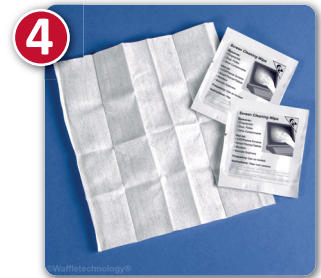
4 Screen Cleaning Wipe