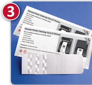
3 Thermal Printer Cleaning Card (2x51mm) featuring Waffletechnology®