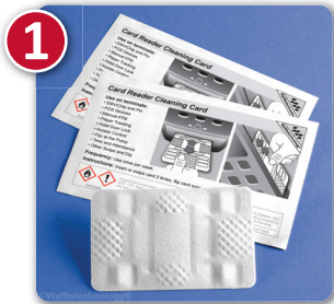
1 Card Reader Cleaning Card featuring Waffletechnology®

Our technical cleaning products are designed to ensure operational efficiency and reduce downtime and maintenance costs: